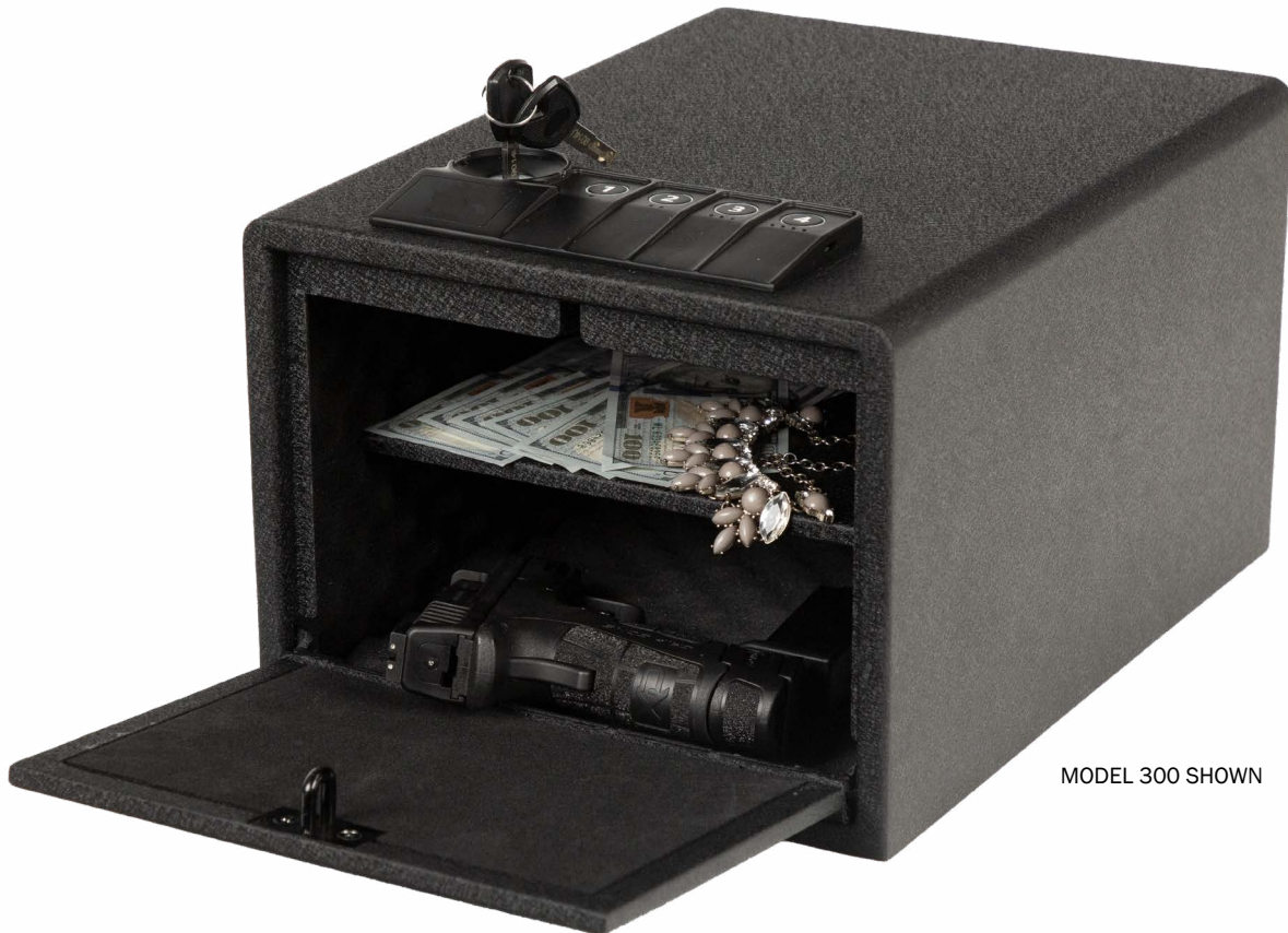
MODEL 300 SHOWN

Quick Touch Vaults come with both Digital and Digital + Biometric opening options, giving you flexibility of how accessible you want your belongings to be. With the digital keypad, you can create a 4-6 digit combination code that can be shared with those who need access. The added Biometric feature allows for fingerprint access to your vault and has the ability to store up to 20 prints, so you and your loved ones can have prompt and secure access to your unit. A key lock is also featured on both models so you are covered with a key-entry backup plan.