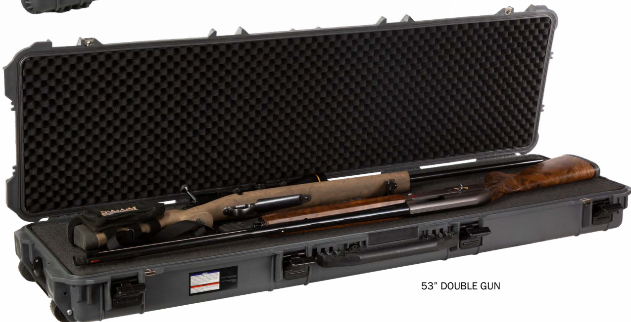
53" DOUBLE GUN